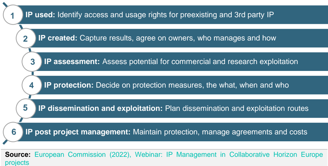
Figure 1: The pillars on which BioGov.net's IP management strategy is founded.

At the start of the project, it is crucial to identify and agree on which existing IP is to be shared among partners and under what terms and conditions (Background), for use during the project (implementation) and after its end (exploitation) if needed (Pillar 1: IP used).