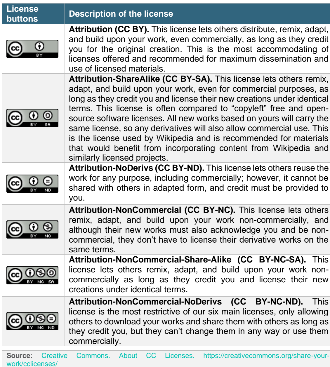
Table 2: The most up-to-date licenses offered by CC

The CC buttons (i.e., the pictures in the first column of the table above) are a shorthand way to convey the basic permissions associated with material offered under CC licenses. Creators and owners who apply CC licenses to their material can download and apply those buttons to communicate the permissions granted in advance to users 20 .